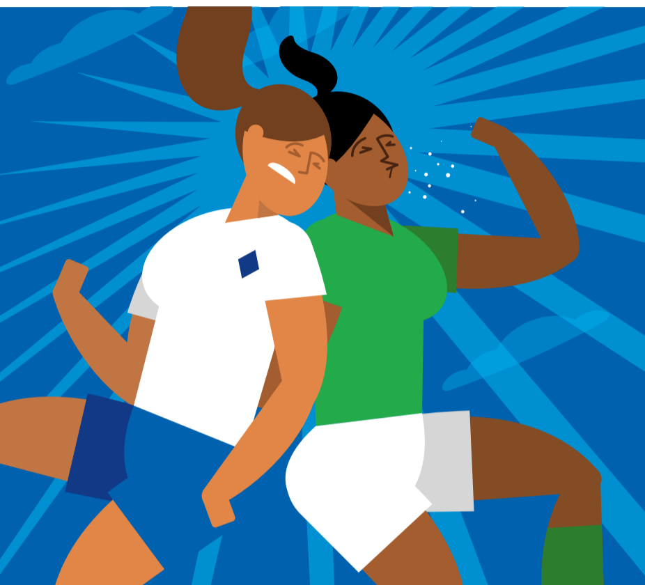
Head injury occurs